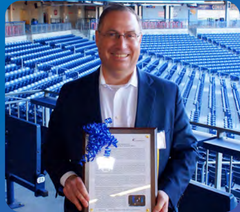
STRENGTHENING FOUNDATIONS OF COMMUNITY AWARD Cornerstone Bank